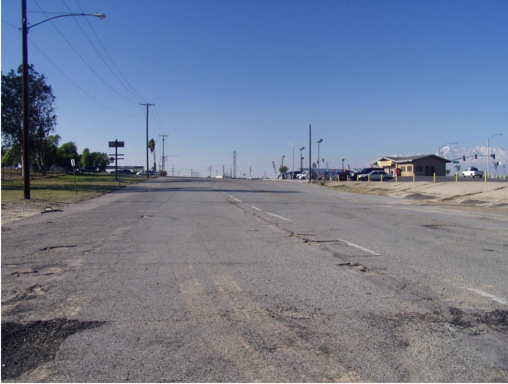
Old Valley Blvd looking west toward Pepper Ave