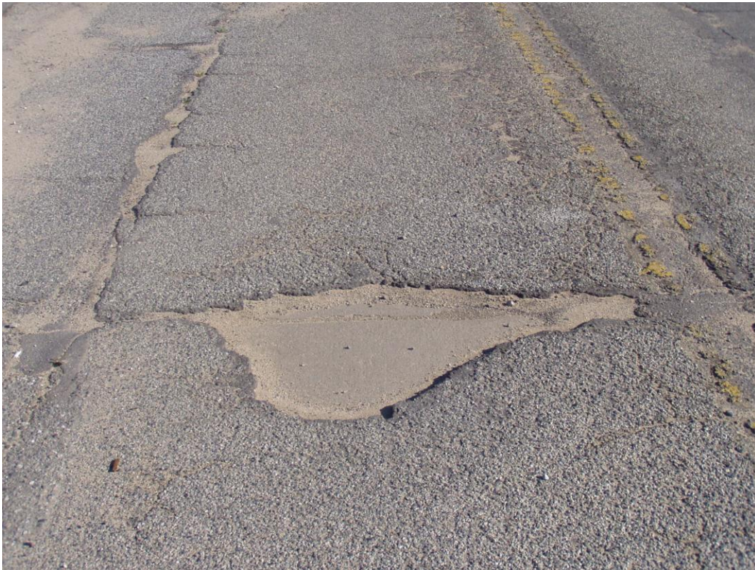
1935 concrete exposed under old Valley Blvd