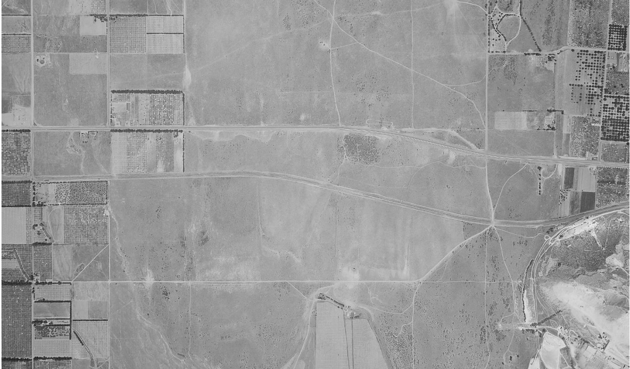
Aerial view from 1939 showing the recently realigned Valley Blvd between Pepper Ave and Meridian Ave.