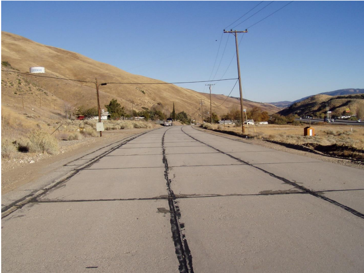
Three-lane US 99 in Gorman, CA

This section of US 99 in Gorman, California was the last section of the original 1933 Ridge Route Alternate concrete. It was resurfaced in 2010 by Los Angeles County. The concrete was poured on June 8, 1933. It remained a part of US 99 until 1951, when Gorman was bypassed by a new four-lane alignment along what is now the I-5 freeway. Few sections of original three-lane concrete remain these days. Only two exist in Southern California now and both are on US 101 (Carpinteria and Mission Viejo). Always make sure to get your photos while you can. You never know when things might go away or be covered up.