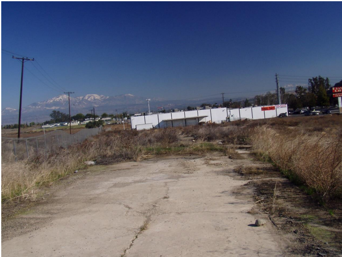
Looking east toward San Geronio Mountain